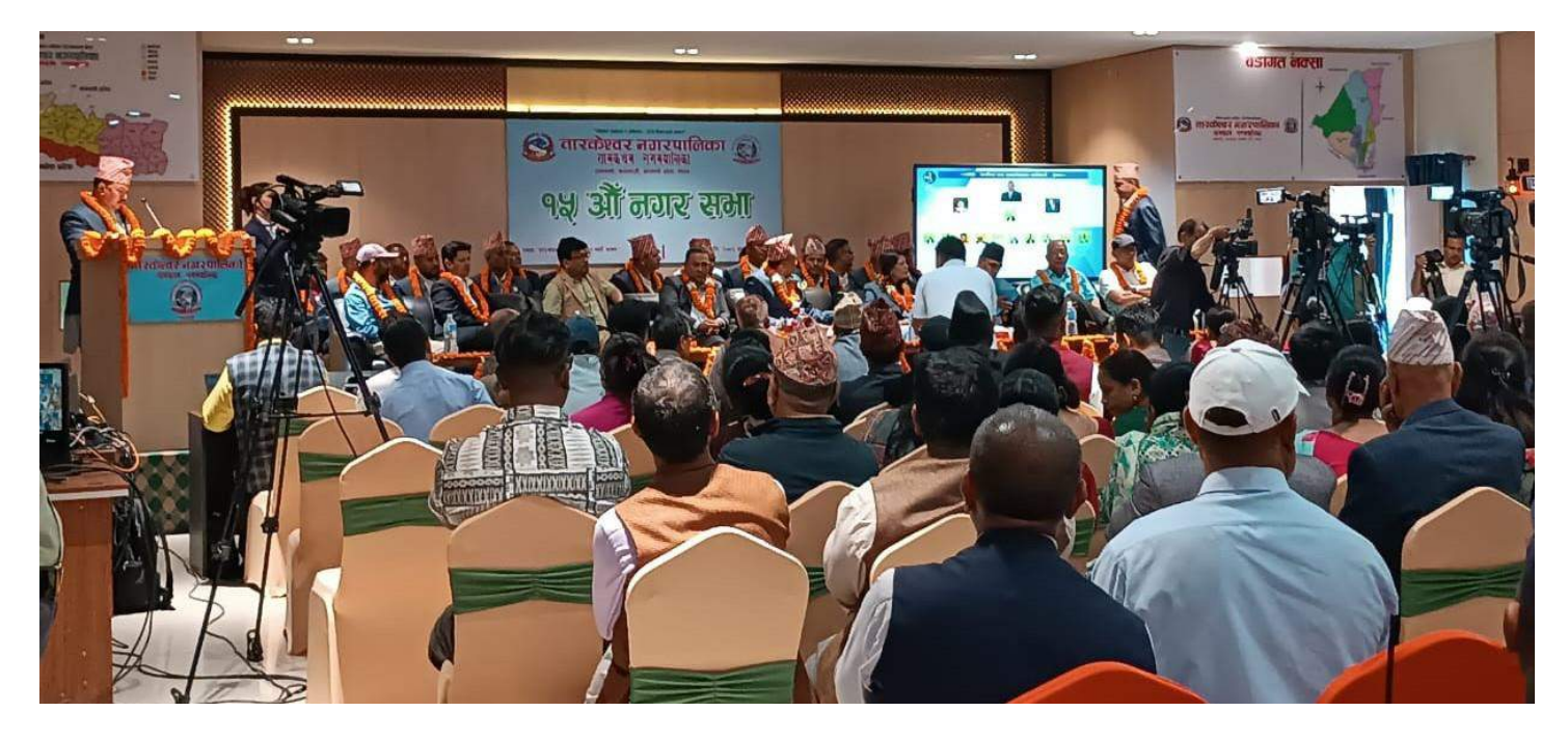
Local level representative in the Municipal Council of Tarakeshwar Municipality

The representative of Nepal Disabled Women Association has participated in the Municipal Council of Tarakeshwar Municipality on June 21,2024. NDWA has started a program against Sexual and Gender based violence (SGBV) women and girls with disabilities in this municipality from 2024 to 2027.