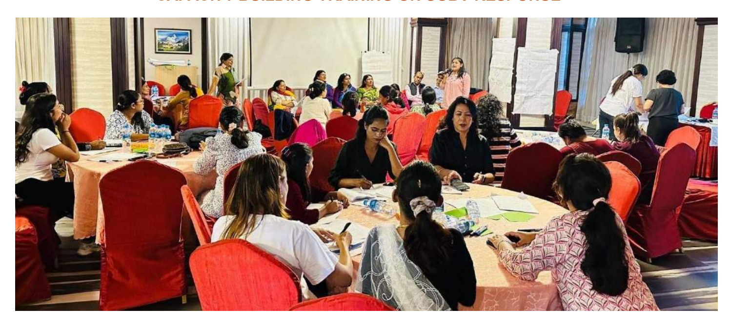
Participants sharing views in the training session