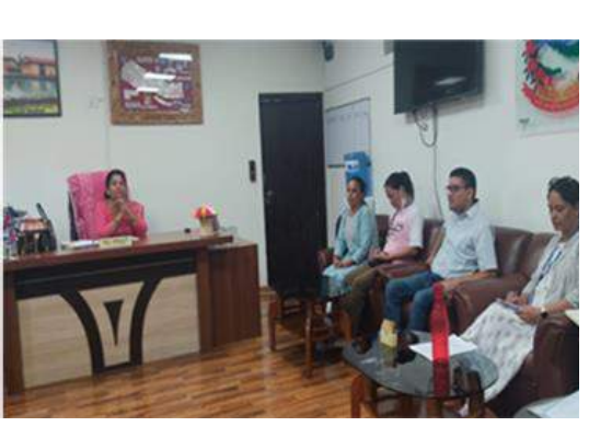
Meeting with deputy mayor and other stakeholders of Godawari municipality to discuss GBV situation within the municipality

Action for Justice (A4J) is aimed at securing accessible justice for women and girls with disabilities who are survivors of gender-based violence (GBV). The project emerged in response to alarming findings from recent research, empirical observations, media reports, and police briefings. These sources have highlighted the persistent challenges faced by women with disabilities in accessing justice and protection against GBV, despite existing laws that promise adequate measures.